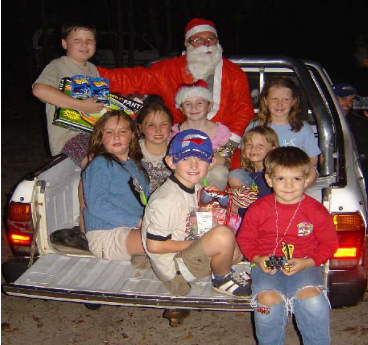
Santa in his high powered Sleigh. At the Club's Christmas Party at Double Island Point. Photo by Phil Woods SC 498