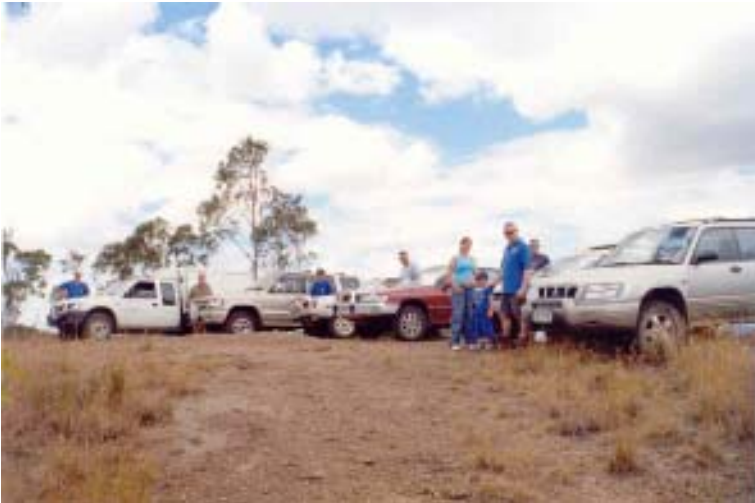
Group shot of vehicles at Mount Widgee.

Adding to the Subaru fleet – Philcomm the communications experts and Suba News advertisers and Club supporters have a fleet of 14 Subaru's ranging from Impreza's up to a Forester GT, WRX, and a Liberty Heritage. The latest model to join the fleet is a rally prepared Impreza RS 2.5 sedan that the proprietors son Matt Van Tuinen will contest in next years ARC super series. It is a new one make series called the Subaru Rally Challenge set up by Subaru Australia for up and coming young drivers. There is up to $100,000 in prize money up for grabs. Matt's current rally car is a group N MY 99 WRX will be used in next years QRC.